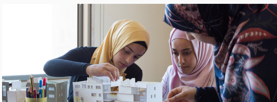
Lebanese and Syrian young people build an architectural model at the UNICEF-supported Girls Got IT event in Lebanon to empower girls, no matter where they are from.