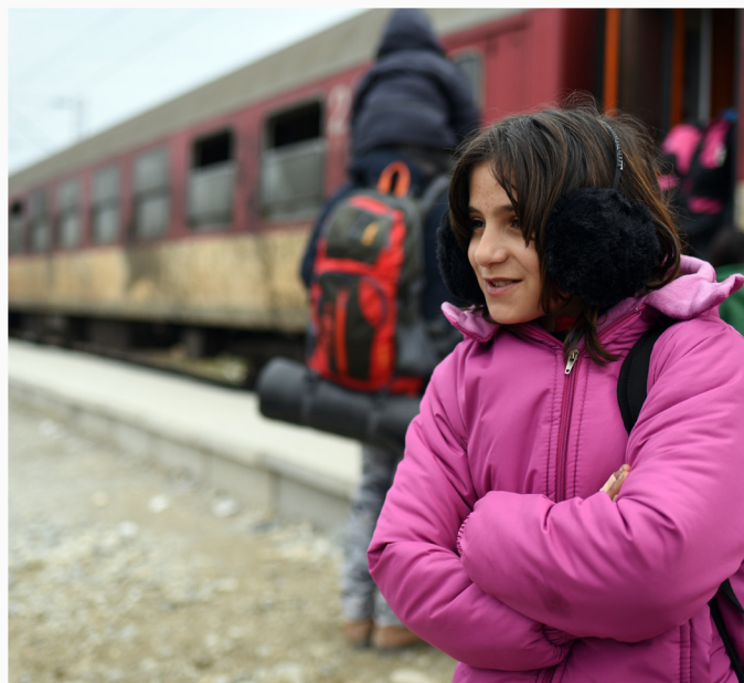
A young girl at the Vinojug transit center, Macedonia, where refugees and migrants often register intent to seek asylum before continuing their journey.

In the northern countries of Central America, UNICEF is focused on interventions to address the root causes of migration by creating and re-claiming safe spaces such as schools, hospitals and playgrounds for children affected by gang violence. UNICEF also supports the sustainable reintegration of returnee children and their families towards long-term solutions.