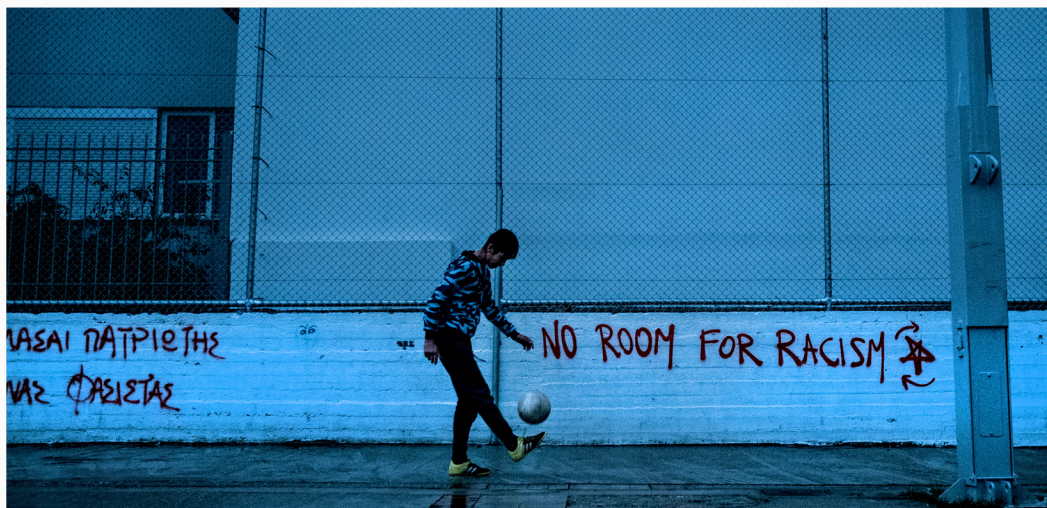
Jalil, 15, an unaccompanied minor from Bamian, Afghanistan, kicks a ball outside the S.O.S. shelter supported by UNICEF in Athens, Greece.

In 2017, UNICEF Honduras and partners, including the Honduran Red Cross, assisted around 12,000 children and adolescents affected by irregular migration; 4,000 children and adolescents to recover from trauma and violence through provision of psychosocial support; and nearly 2,000 to enrol in non-formal educational or technical training options.