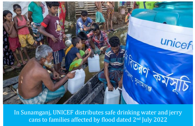
In Sunamganj, UNICEF distributes safe drinking water and jerry cans to families affected by flood dated 2 nd July 2022

UNICEF started repairing the tube-wells using its internal resources, UNICEF distributed 20,000 Jerricans and 2,000 Hygiene Kits. UNICEF partner, FIVDB continues to provide safe water to over 1,000 mostly affected people through water trucking. With UNICEF support, accumulative number of 846,600 people have been reached with WASH interventions since the beginning of the flood.