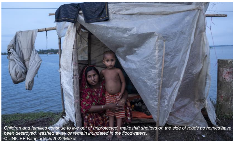
Children and families continue to live out of unprotected, makeshift shelters on the side of roads as homes have been destroyed, washed away or remain inundated in the floodwaters.