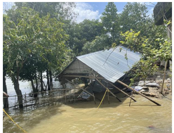
A learning center inundated in Poshchim Birergaon Union of Shantiganj upazila, Sunamganj

Out of some 3,000 primary schools of Sylhet and Sunamganj districts, more than 80 per cent of primary and secondary schools have been inundated affecting nearly 673,000 children 4 . A total of 285 learning centers have been severely damaged negatively impacting the education of some 8,000 children. A rapid assessment conducted on 4 th July revealed that nearly seven per cent of the learning centers have been completely destroyed and most of the other learning centers are partially damaged. UNICEF is supporting early restoration learning plan in those centers, however, education activities remain halted in all 275 flood-affected educational institutions. More than 150 educational institutions are still used as shelters.