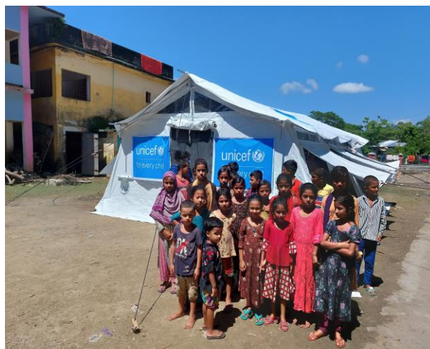
A Child Safe and Recreational Space at a Shelter in Sunamganj

With UNICEF assistance, the Risk Communication and Community Engagement (RCCE) Consortium partners NGOs in Sylhet region have reached over 460,000 population (184,000 women) through 80 courtyard sessions and distributed 6,000 leaflets in the community and shelters. The consortium continues to disseminate messages on hygiene and sanitation practices and preventions of AWD and COVID-19.