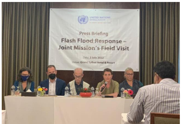
Press briefing by the UN/Donor delegation in Sylhet dated 2 nd July