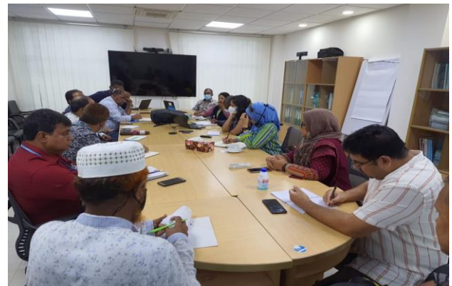
During a coordination meeting among UN agencies in Sylhet UNICEF Office, dated 30 th July 2022

On 2 nd July, the joint UN and Donor mission led by the Resident Coordinator visited areas devastated by the flood and held discussions with the affected populations and local authorities. The delegation also witnessed the ongoing responses supported by UNICEF and humanitarian actors such as Mobile health camp, Nutrition screening, Expanded Programme on Immunisation (EPI), Water trucking, Child Safe and Recreational Space, and distribution of Non-Food Items in Sunamganj district, and held a press briefing.