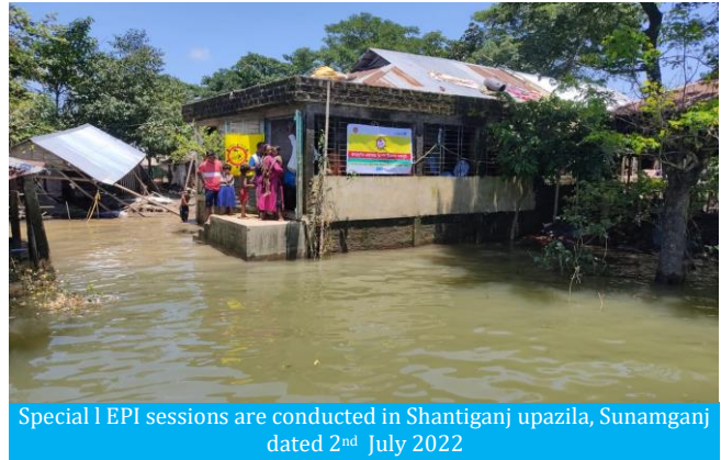
Special I EPI sessions are conducted in Shantiganj upazila, Sunamganj dated 2 nd July 2022

The curative and preventative services continued under the UNICEF supported contingency programme, Friends In Village Development Bangladesh (FIVDB) conducted medical camps in three upazilas reaching about 75 children. In addition, two emergency medical camps have been organized in two upazilas reaching about 700 people from the flood affected communities of Sunamganj with health services. 700 cartons of therapeutic milk are in the pipeline to meet the needs.