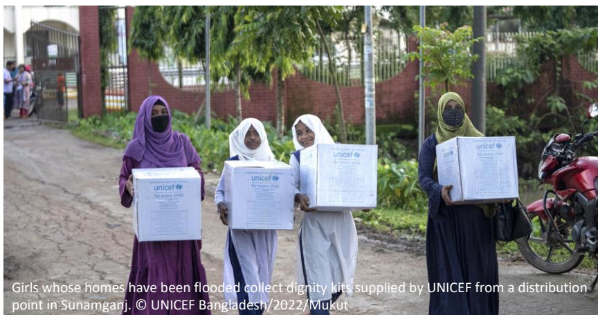
Girls whose homes have been flooded collect dignity kits supplied by UNICEF from a distribution point in Sunamganj.