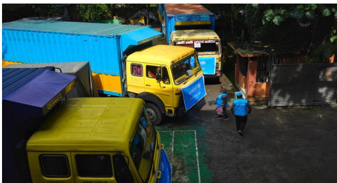
UNICEF supplies arriving in Sylhet

UNICEF supported nutrition centres to provide lifesaving therapeutic and preventative nutrition services to the displaced population and those living in the affected locations. 84 children were identified with Severe Acute Malnutrition (SAM) and 70 were admitted in the SAM unit of Upazila health complexes for treatment. UNICEF provided 2,136 cans/pots of therapeutic milk (F-75 and F-100) to the Civil surgeon office and Upazila health complex totalling US$ 10,106. Procurement of 60 cartons of therapeutic milk and nutrition kits for SAM treatment to the civil surgeon office and district hospitals is underway.