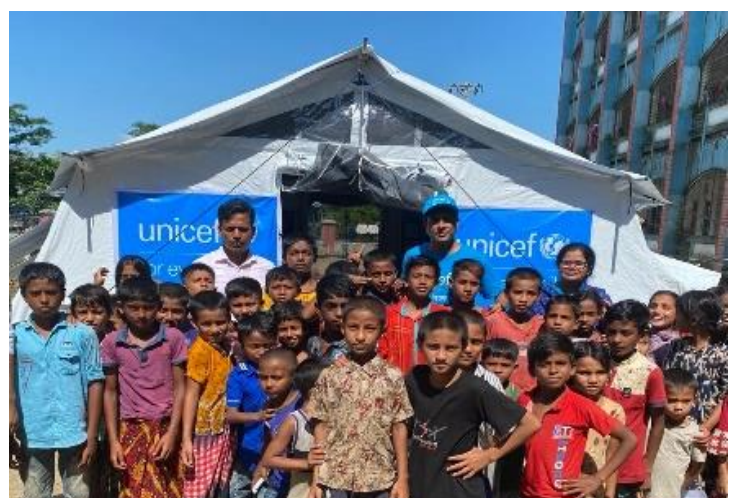
Children at a Child Friendly Space supported by UNICEF at Department of Social Services in Sylhet

With UNICEF assistance, the Risk Communication and Community Engagement