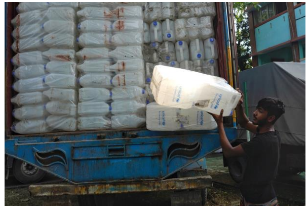
supplies arriving in Sylhet

UNICEF and partners conducted chlorination of 46 waterpoints and continued water trucking, distributing hygiene kits, jerry cans and water purification tabs to the displaced population focusing on the most vulnerable people. 4,173 Hygiene Kits and 31,236 jerry cans are in delivery pipeline, expected to arrive by 31st July and benefit 85,101 affected people. In the remote sub-districts, safe drinking water has been provided through two UNICEF supported water treatment plants and reached 500 affected people daily.