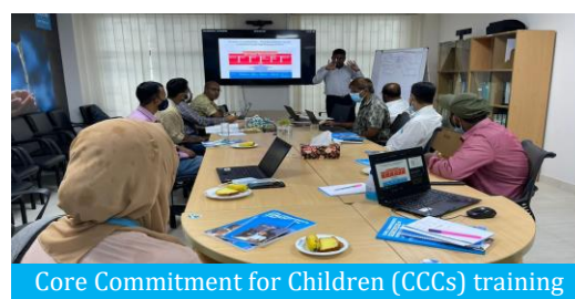
Core Commitment for Children (CCCs) training

UNICEF organised a training on Core Commitments for Children (CCCs) for four Government and non-governmental partner organisations and UNICEF staff working in Sylhet division on 7th July 2022. The objective of the training was to provide a refresher on CCCs commitments and benchmarks to humanitarian workers. The session also covered policies, programmatic and operational commitments, and accountabilities on humanitarian response.