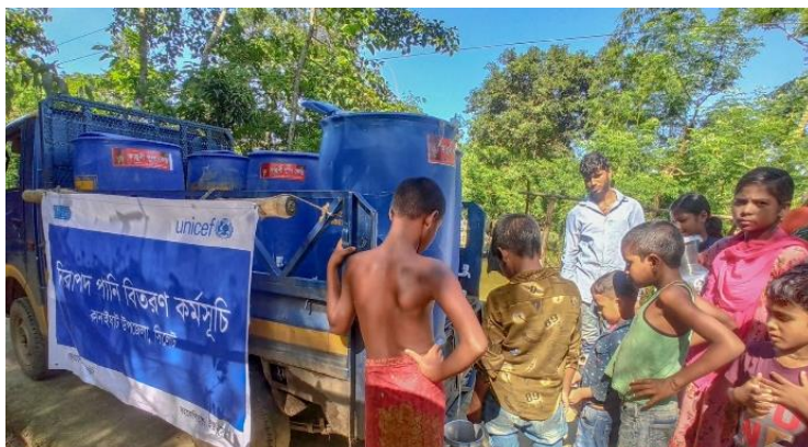
Water trucking took place in Kanaighat Upazila, Sunamganj