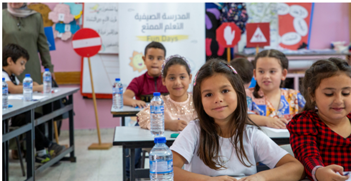
Students posing to the camera during UNICEF-funded fun days activities implemented in their school in the West Bank.