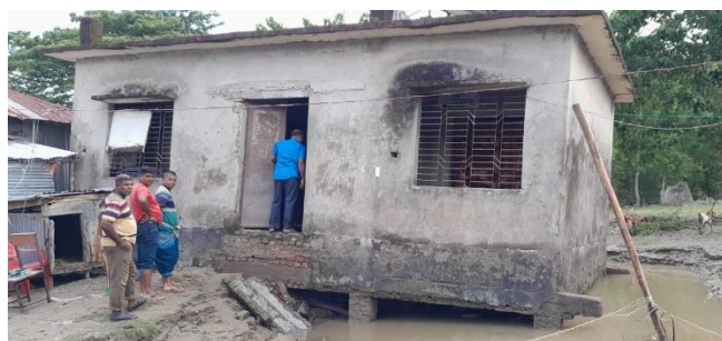
The floor of the Community Clinic was totally damaged. This is the only health facility in this union.