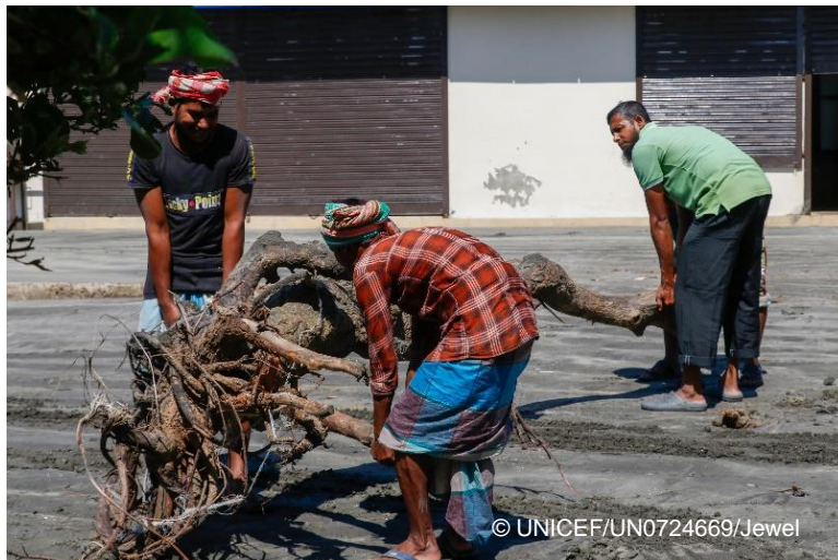
In the aftermath of Cyclone Sitrang, people clean up in Kuakata, Patuakhali.