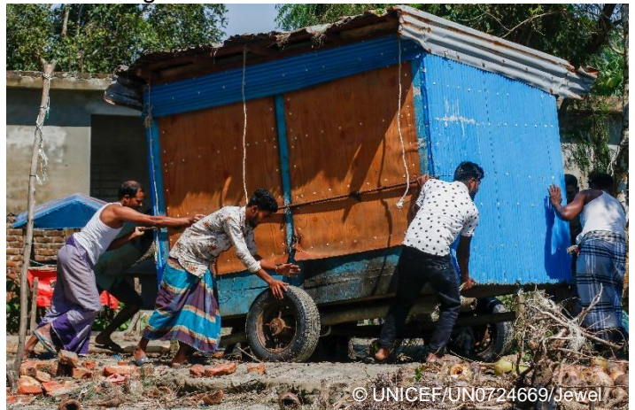
A woman whose tin house has been damaged by the cyclone, returns to her homestead.