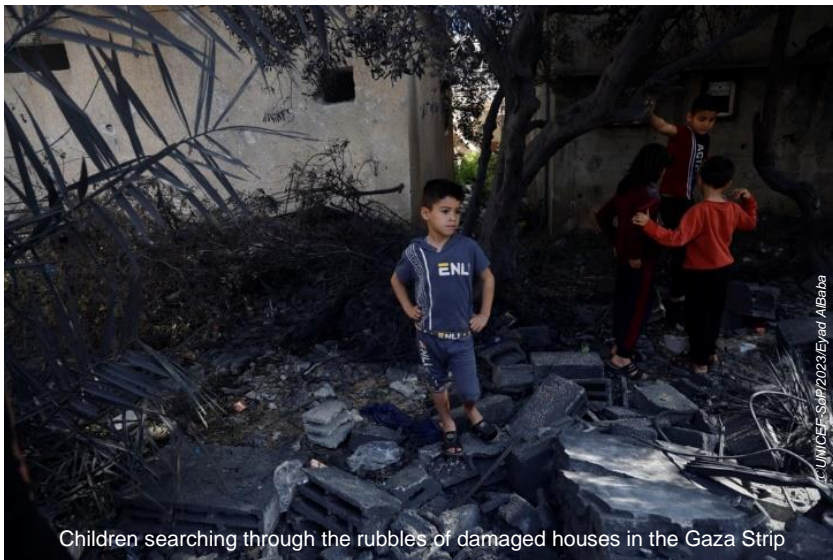
Children searching through the rubble of damaged houses in the Gaza Strip