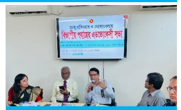
Divisional level advocacy meeting in Chittagong on Dengue prevention