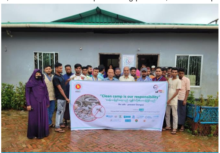
Cleaning camping at camp 18 PC: Photo credit: Ali Haider