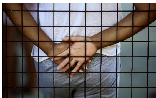
Photo: On 8 March 2016, a girl stands in front of a fence watching older girls play a volleyball match at the UNICEF-supported Marillac Hills Centre in the city of Muntinlupa, in Metro Manila, Philippines. The government-run shelter is a safe haven for girls who have been physically and sexually abused, with many exploited through live streaming of child sexual abuse and the sex tourism industry.

Finally, in 2005 SAARC established the 'South Asian Initiative to Prevent Violence against Children', one priority of which is to address sexual abuse and exploitation. The regional work plan for 2010-2015 singles out sexual exploitation of children in the context of travel and tourism, as a pervasive violation of children's rights in South Asia. 37