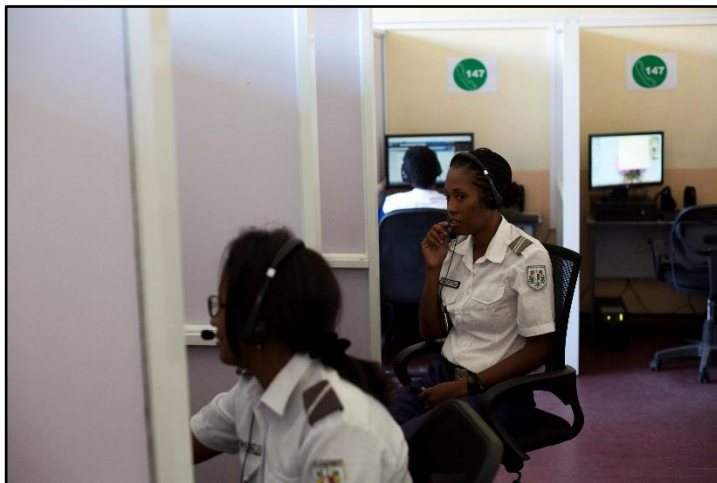
Photo: On 29 March 2016, a female police officer monitors calls from victims of child sexual abuse at a UNICEF-supported help centre for abused children in Antananarivo, the capital of Madagascar.

In the early 1990s private travel and tourism entities began to take action against the sexual exploitation of children, largely in response to reports of child sexual exploitation in the context of travel and tourism in Asia. 22 In 1994 the Universal Federation of Travel Agents' Associations (UFTAA) adopted 'The Child and Travel Agents' Charter', becoming the first tourism industry association to address the issue. 23 The Charter required members to assist organisations that provide recovery services to victims of sexual exploitation. Other policy documents and codes of conducts of tourism industry organisations and unions affiliated with the travel and tourism industry were also adopted following the UFTAA and UNWTO statements and the First World Congress, (see Box 2):