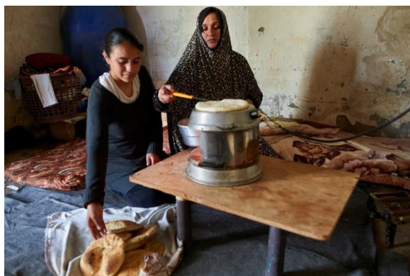
Palestinian girl makes bread with her mother in Gaza strip

Eight children have been killed since the beginning of 2019 in the context of the Great March of Return, while 979 children have been hospitalized due to injuries. According to OCHA reports, since 30 March 2018, 58 children (55 boys and three girls) have been reported killed in Gaza and more than 7,000 injured, with over 3,600 requiring hospital treatment.