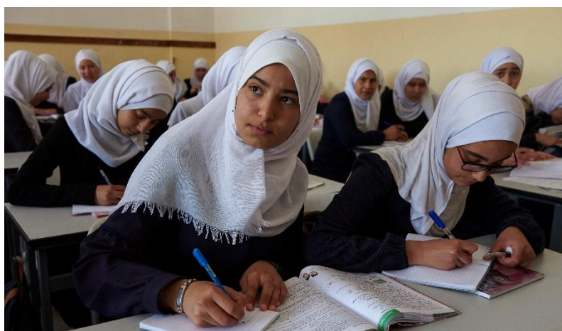
Girls during an English language class at a UNICEF-supported Secondary School in Northern Gaza Strip.

UNICEF supported 6,150 children (2,364 girls) and 702 teachers with protective presence on their way to and from schools in Area C and the H2 area of Hebron city in the West Bank. Challenges in accessing children's rights to education were noted as they daily cross military check points and go through closed military zones on their daily commute to school.