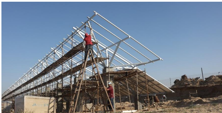
UNICEF upgrades Khan Younis wastewater treatment plant in southern #Gaza Strip with 250KW solar system energy.

In the period under review, UNICEF also supported the improvement of WASH services in Al Zaitoon and Bani Suhaila health centers in Gaza through the rehabilitation of sanitary facilities, provision of a water-well and small-scale desalination unit in each health center. Urgent rehabilitation works were also conducted on the old water network in Al Shifa Hospital in Gaza. In partnership with a local NGO, UNICEF assessed the WASH status in health facilities, to inform the WASH and Health Clusters in identifying and concurrently monitoring priority WASH preparedness and response interventions. UNICEF also supported the establishment of a surveillance mechanism for WASH in Health facilities with key stakeholders from the WASH and Health Clusters as an emergency triggering system.