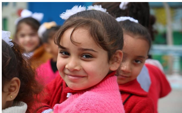
Child playing at a school in Gaza