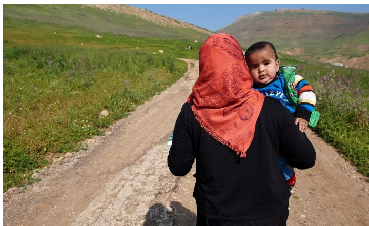
Mother takes her child for medical check at one of UNICEF-supported mobile clinics in northern West Bank.

UNICEF coordinated the Nutrition Sub-Cluster Working Group activities in Gaza. The results of the Gaza nutrition needs assessment have triggered an urgent call for action under the nutrition Sub-Cluster Working Group including WFP and Save the Children. As a result, key nutrition players and Health Cluster partners are developing a joint interagency action plan for Maternal Infant Young Child Nutrition in Emergencies (MIYCF-N) including budgeting an operational plan for the Gaza Strip. During the reporting period, UNICEF jointly with NGO partners provided treatment to 82 children with severe acute malnutrition (SAM), and 237 children with moderate acute malnutrition (MAM).