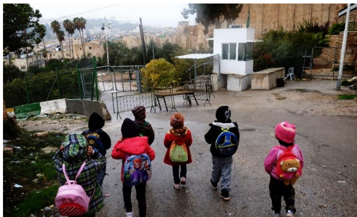
Children walk from Kindergarten, situated next to the al- Ibrahimi mosque, to their homes. On the way they pass a booth with Israeli soldiers and military checkpoints

In the West Bank, incidents of demolitions and violence were reported over the reporting period. A total of 305 4 structures were demolished in East Jerusalem leading to the displacement of 439 people including children. A total of three children (one boy and two girls) were killed in violence-related incidents in the West Bank.