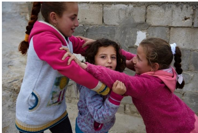
Girls playing at one of UNICEF-supported communities in Hebron's hills, southern West Bank.

Since 30 March 2018, UNICEF and members of the Child Protection Area of Responsibility (CP AoR) have provided child protection services to 2,727 children (4% girls) injured during the GMR (75% of the 3,600 children hospitalised). Of these children, 690 were referred for specialist case management support and 1,000 to structured psychosocial support services. Child protection specialists in UNICEF-supported family centres have identified and reached 559 injured children (20%) through home visits and provision of psychological first aid, 212 children accessing structured psychosocial support and 233 received individual case management support. The increasing needs in Gaza have overwhelmed the capacities of child protection partners. Timely case management support, including mental health and psychosocial support (MHPSS), is needed to prevent later manifestation of mental health illnesses. UNICEF-supported family centres have identified and reached 559 injured children (20%) through home visits and provision of psychological first aid, with 212 children accessing structured psychosocial support and 233 receiving individual case management support. The increasing needs in Gaza have overwhelmed the capacities of child protection partners. Timely case management support, including MHPSS, is needed to prevent later manifestation of mental health illnesses.