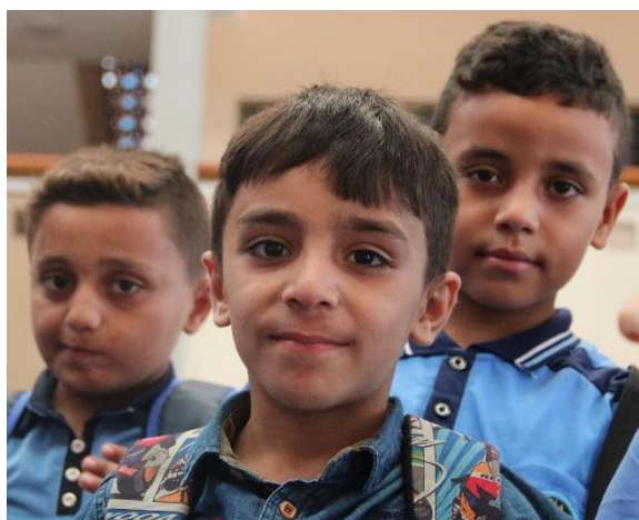
Children at UNICEF supported activities in Gaza