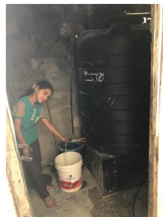
A family benefitted from the installation of water tanks in North area.

The 2017 HNO (which informs WASH HRP 2018), indicated that approximately 1.8 million persons are in need of humanitarian WASH assistance, out of which 52 per cent are children. To respond to this crisis, the WASH Cluster coordinated the supply of emergency fuel to more than 130 critical WASH installations in Gaza benefiting all residents of the Gaza Strip and carried out the winter preparedness and response which revealed that over half a million persons are at the risk of floods. Approximately 26,640 people, including 13,320 children, benefited from improved access to water as a result of UNICEF's interventions in Gaza during the first six months of 2018. UNICEF leveraged the presence and strength of its long-standing partners to reach more people with WASH interventions. In this regard, in partnership with Action Against Hunger (ACF), UNICEF reached 2,320 households, including 6,960 children in Gaza with water storage tanks to increase the household storage capacity when water supply is low. To address the unaffordability issue in the West Bank, which is a key barrier to access, 7,904 persons, including 3,978 children, have been provided with improved and increased access to drinking water at a subsidized price.