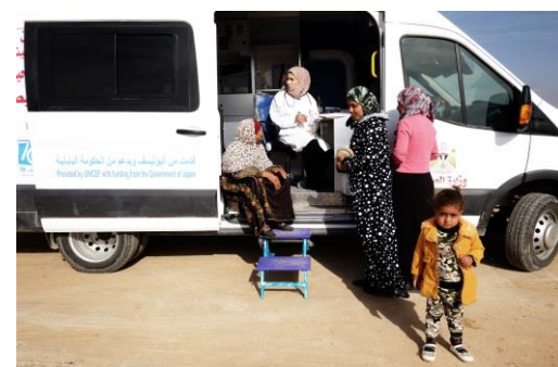
Health care delivered through the mobile clinic in Bedouin community Area C.

Since the beginning of 2018, approximately 32,300 children and women in Gaza benefited from improved health and nutritional services from hospitals, clinics and outreach teams. In West Bank, almost 1,546 (30 %) children were reached with mobile clinic services, operated by Ministry of Health in Yatta, Dura and Tubas, including vaccination, acute illnesses treatment and MCH services. Procurement of essential MCH equipment is underway to support a newly established PHC – facility in H2 serving almost 40,000 citizens, of which almost 17,500 are women and children U5.