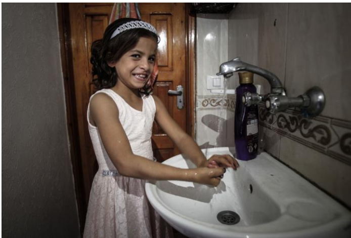
A girl is washing her hands from running water in her home Gaza Strio