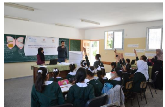
Training of a mediation team in Gaza.

Due to the shortage of the operational budget for education and the current electricity crisis in Gaza, the Ministry of Education and Higher Education requested support from UNICEF in the provision of fuel to operate the generators in examination correction centers to ensure the smooth conduct of the Tawjihi national exam for high school students. Due to the urgency and critical nature of this high stakes examination, fuel was delivered and distributed to operate generators in the schools and the Examination Correction centers which benefited 28,114 grade 12 students. Emergency education supplies (stationery, student kits, and teaching and supplies) were also provided to 48,895 vulnerable, unserved or underserved students and teachers in Gaza.