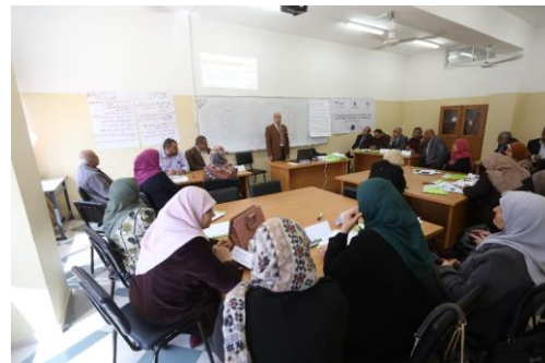
Teacher training program on non-violence, Gaza. UNICEF 2018.

Following months of preparations for the “Keeping Kids Cool”, a psycho-social support program for children of grades 1-9 during the summer months, it will take place from end July to mid-August, in Gaza.