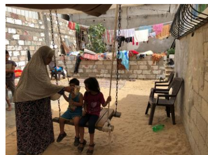
A family benefitted from the installation of the MIT prototype for safe drinking water in Khan Younis.

In partnership with the Massachusetts Institute of Technology (MIT), UNICEF has installed a Photovoltaic-driven Electrodialysis Reversal (PV-EDR) prototype desalination unit at a water well in Khan Younis, operating on solar energy. This prototype is serving around 3,000 people in the area with safe drinking water with much lower energy requirements than conventional desalination plants. Furthermore, UNICEF continued supporting the Coastal Municipalities Water Utility (CMWU) in distributing chlorine and chemicals for 110 water wells in Khan Younis, Middle and Rafah, reaching more than 500,000 residents connected to the municipal networks, including over 250,000 children. In addition, UNICEF and the CMWU completed the construction of AlZahra sewage pumping station benefitting around 15,000 people in the area, including around 7,500 children. Upgraded water and wastewater networks in Khan Yunis and Rafah are benefitting around 6,300 people in the two areas, including around 3,150