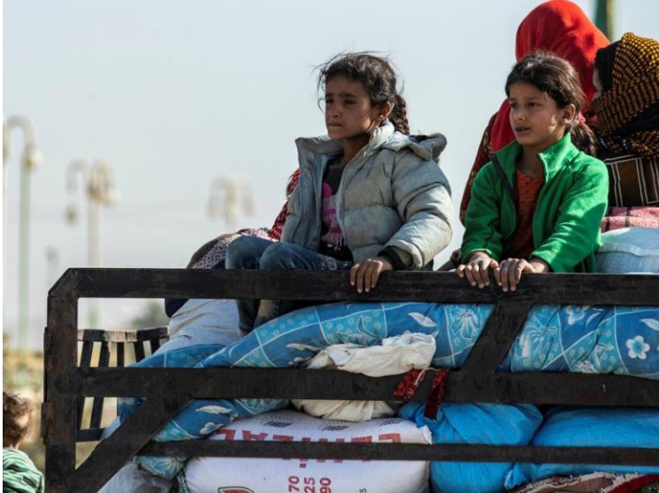
Some children fleeing escalating violence in Northeast Syria to Tal Tamer, with their families.