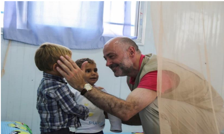
UNICEF Syria Representative interacting with children at a UNICEF-supported interim care centre in Al-Hol camp, northeast Syria.