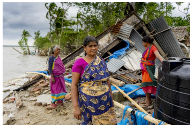
Thousands of houses are damaged as embankments collapse and due to tidal surge.

UNICEF and partners also assessed the WASH situation in 223 cyclone shelters. Among them were 703 gender-segregated toilets, 216 water points for drinkable water and 536 water taps with soaps for hand washing purposes.