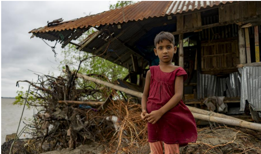
Children and families are returning to their damaged houses in Mongla